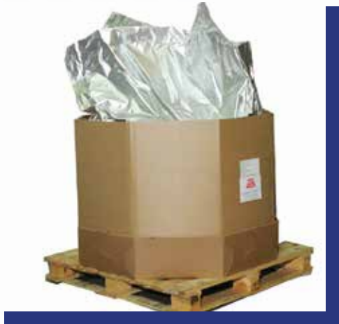
Octabin shape aluminum liner