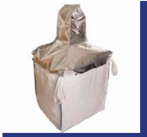
Aluminum liner with jumbo bag