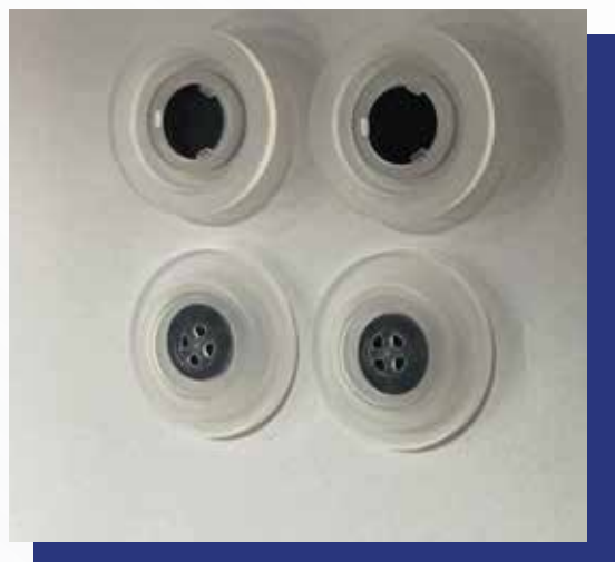
Non Return De-Gassing valve Fitment